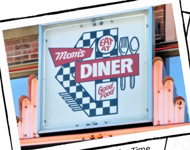
Memories of a Simpler Time