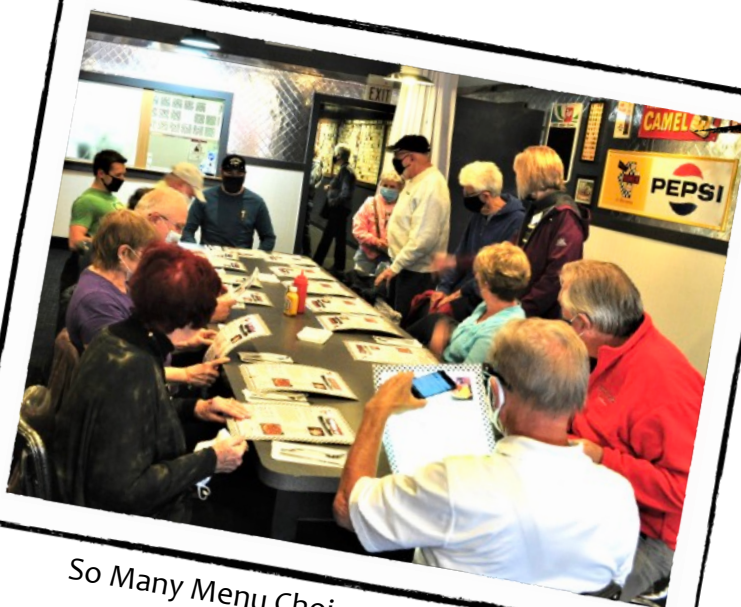
So Many Menu Choices, So Little Time