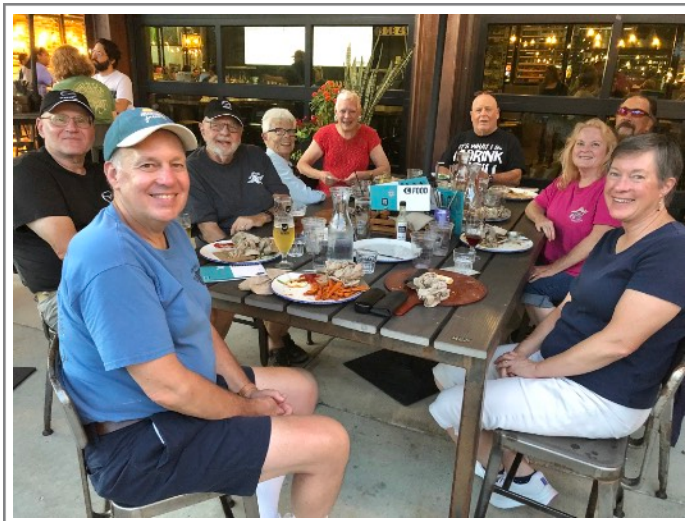
Dinner Friday night at BrewDog