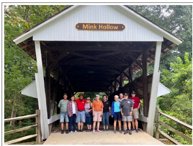
Covered Bridges seemed to be a theme this year for interesting sights along the way. Mink Hollow covered bridge was originally built in 1887.